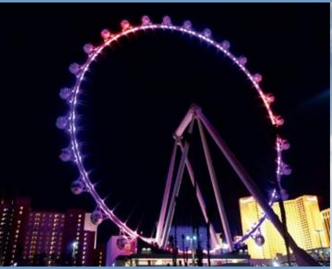
A High Roller with TMDs for Protection from Wind Forced Vibrations, Las Vegas, USA